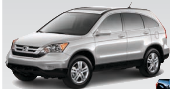
2010 Honda CR-V