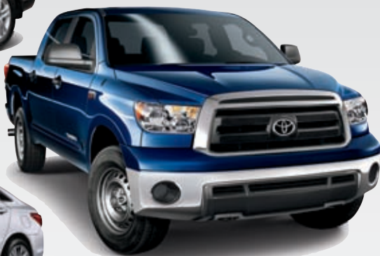
2010 Toyota Tundra