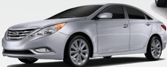
2011 Hyundai Sonata

More Than 2000 NEW Vehicles More Than 1000 USED Vehicles Cars & Trucks for All Budgets