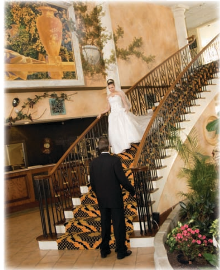
The elegant grand staircase at the Tuscany House Hotel