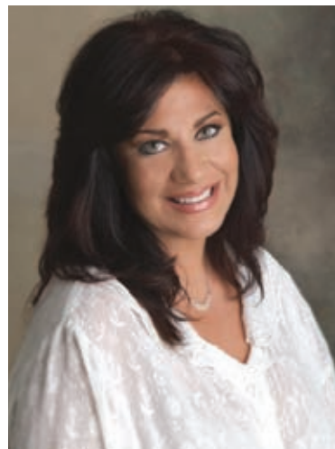
WRITTEN BY: NANCY ADLER, C.F.T., S.P.N., S.S.C. SPECIALIZING IN NUTRITION & WEIGHT CONTROL NANCYS TEACHES "INTUATIVE EATING LIFESTYLE"

Protein Bars and Weight loss are now more closely linked than they ever have been. That's because advancements in nutritional understanding, combined with a competitive market for protein bars, have led to highly effective and affordable bars that are honed to meet individual goals. So they say.